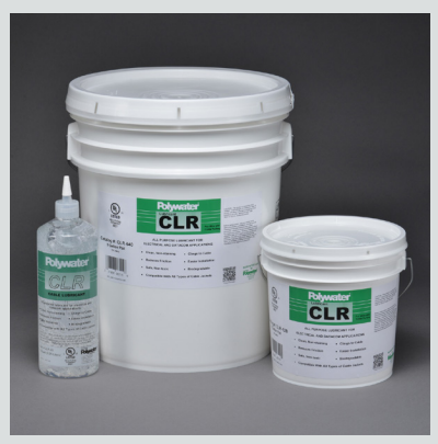
CLR packaging (drum not pictured)