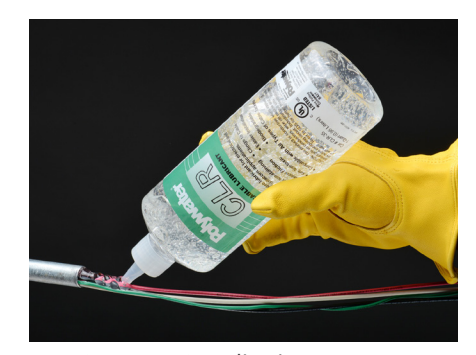
EMT, GRS, or PVC applications