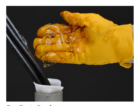
Excellent cling factor

Polywater<sup>®</sup> CLR Clear Cable Pulling Lubricant is a clear, colorless, clean, slow-drying, easy-to-apply gel lubricant. This thick gel lubricant was developed to avoid drippage for easy handling and application.