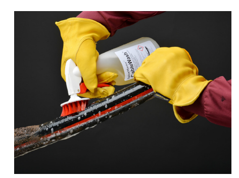
Brush head removes dirt easily

Polywater<sup>®</sup> CableWash<sup>™</sup> is a water-based cleanser that can be used even in cold weather environments to safely and effectively remove mud, dirt, and grime from cable jackets without harm. Cable cleaners, when sprayed directly onto jackets, can adversely affect their properties.