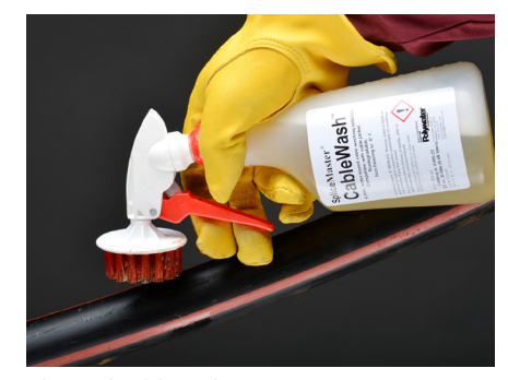
Cleaned cable jacket