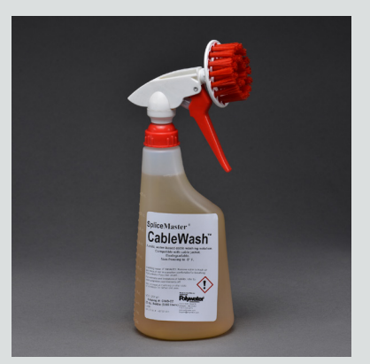
Catalog # CWS-22