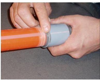
Smooth Excess Material

Place BonDuit<sup>®</sup> Conduit Adhesive cartridge into dispensing tool and snap into place. See tool instructions for more information.