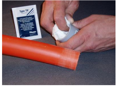
Clean Coupling and Conduit with Cleaning Wipe