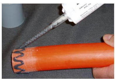
Apply BonDuit® Adhesive